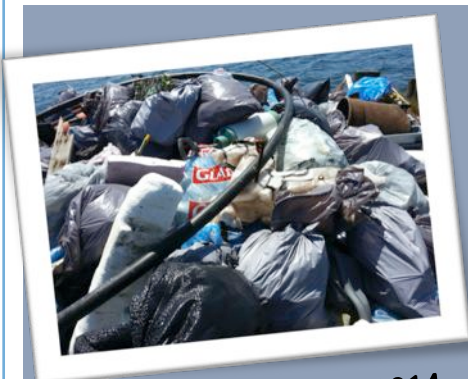
McNab Island Clean up 2014

Community members are invited to participate with the construction on June 6 th and by taking a 'chalk board pledge photo' of 3 things they can change in their lifestyle to improve ocean and community health.